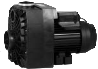
43 Series Pump with no strainer (NS)