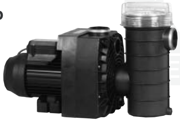
43 Series Pump with large strainer (LS)