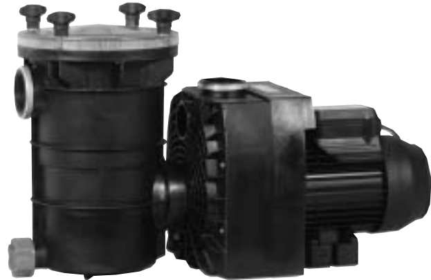
43 Series Pump with giant strainer (GS)