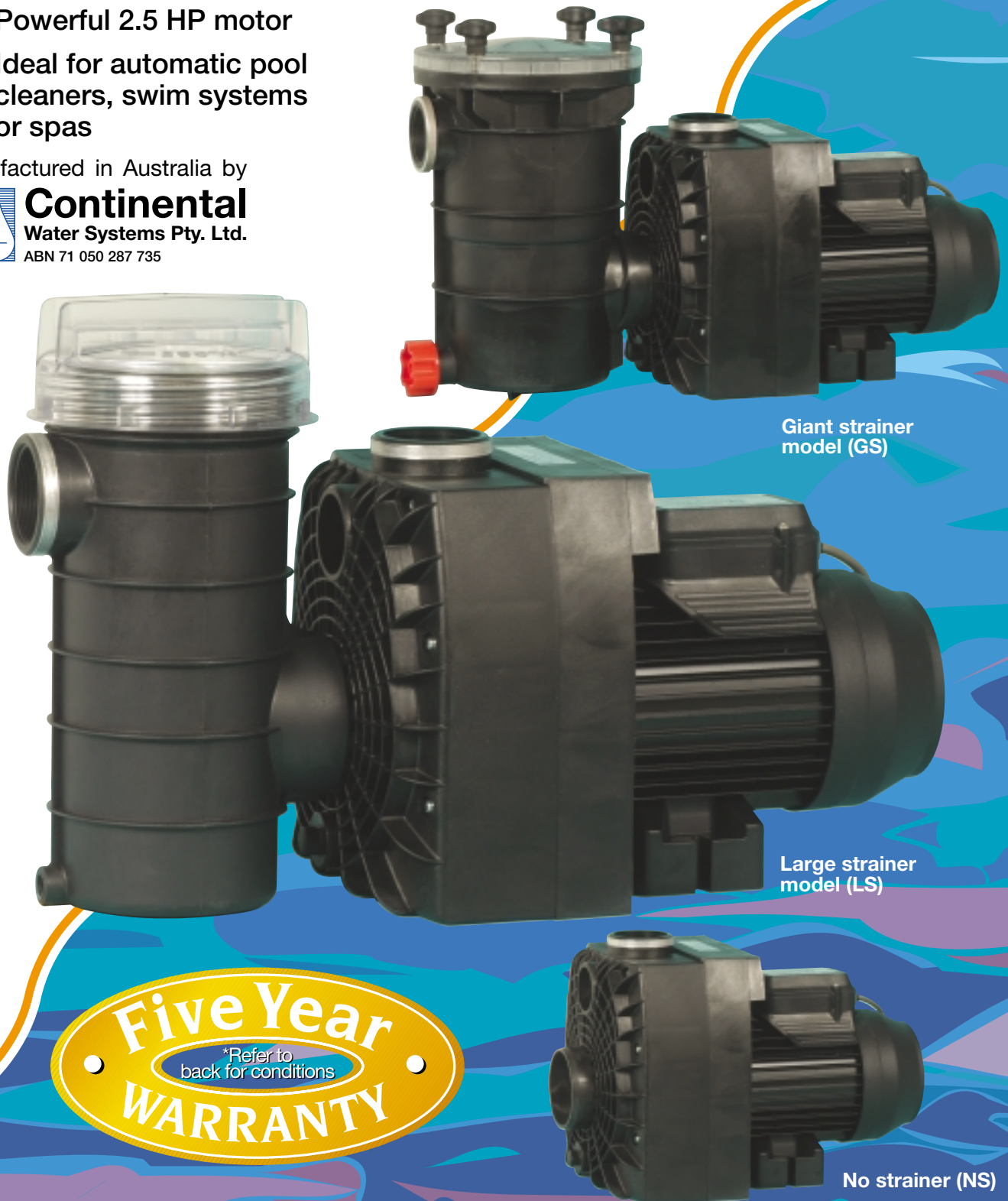
Giant strainer model (GS)